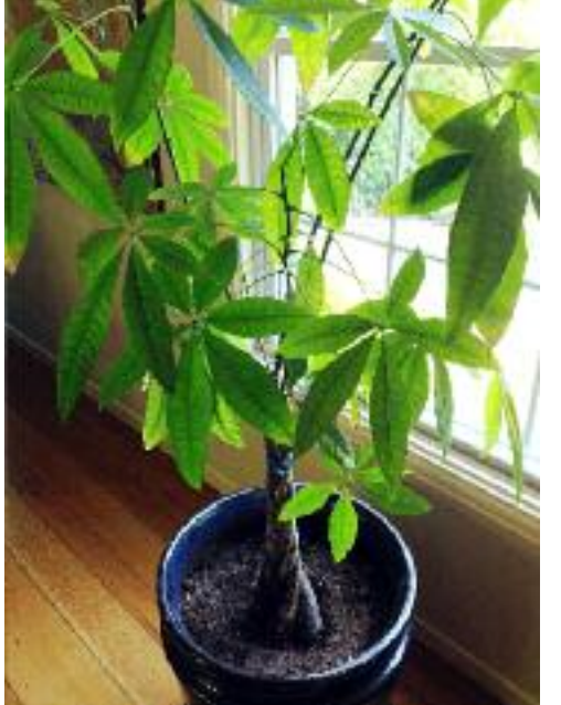
A money tree symbolically activates the Wood area of this Lafayette home.

Make sure to go to this far left area of your home and analyze what is there: a cluttered storage room or closet, a bathroom, or some other representation of lacking can drain energy. One of my local clients has a leaking roof and unfinished bathroom in this area and says they have constant "financial leakages" as well. Sometimes, the feng shui is quite literal. Needless to say, fixing this problem is at the top of this homeowner's list. Remember, nothing should be "broken" in this area or you are energetically and quite literally broke.